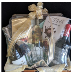
Wine basket donated by GSV

Meaningful events such as Ben's Run serve as a reminder to us all that the Greater Stonegate neighborhood is a vibrant, caring and supportive community and the Greater Stonegate Village is proud to be an active part of it.